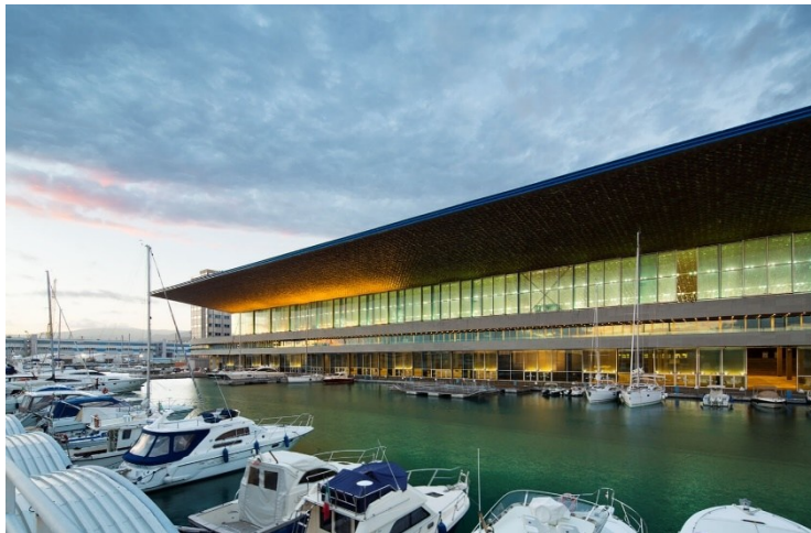
Hall of preliminaries

Address: P.le John Fitzgerald Kennedy, 1 16128 Genova GE Italy