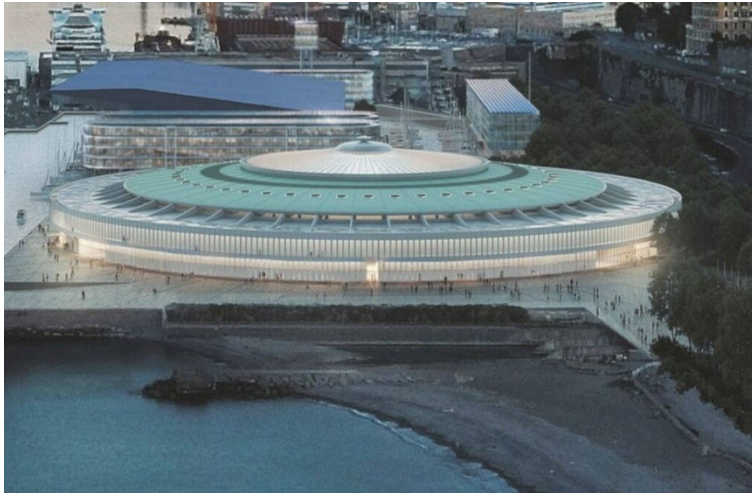
Hall of finals

Address: P.le John Fitzgerald Kennedy, 1 16128 Genova GE Italy